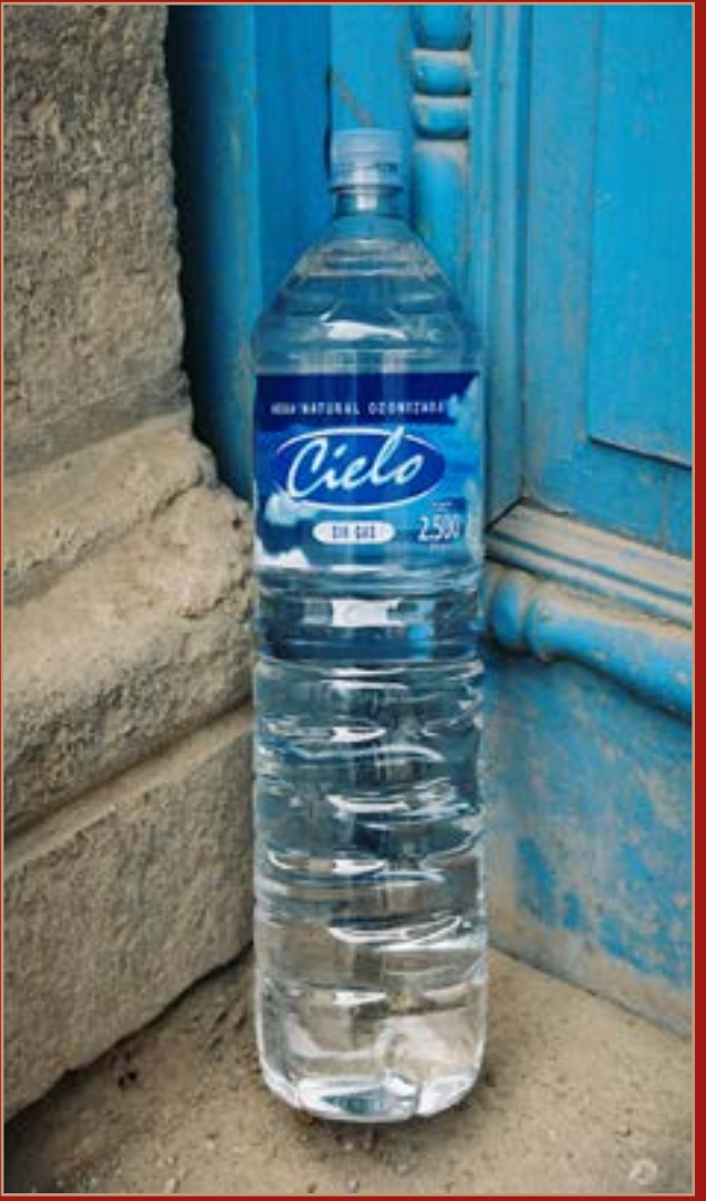
Water Bottle. Cielo Brand. Dasani and Nestle 's bottles were copyrighted. Ein Mayim Eleh Torah. 2014