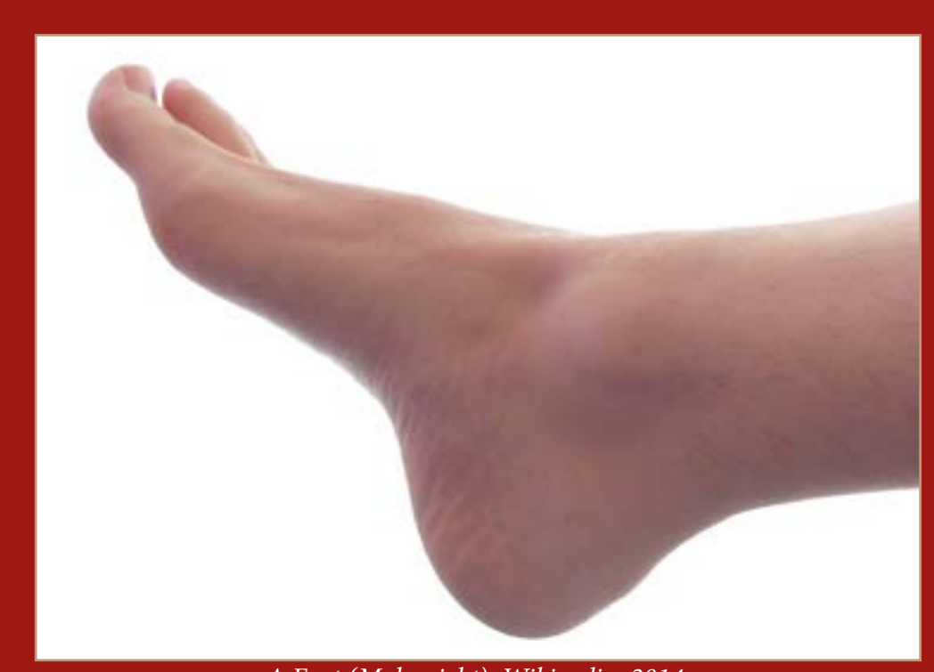
A Foot (Male, right).